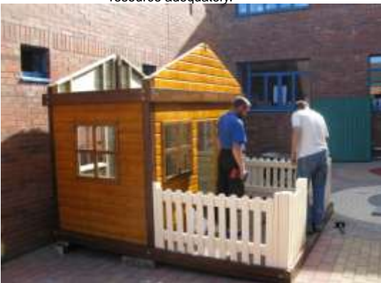
Building the Outdoor play house

We have opened up a special new outdoor play area for Primary 1 & 2 pupils (Foundation Stage). This type of play is recommended as part of the revised curriculum and helps the children develop manipulative and motor skills. More equipment is to be added and the teachers will be attending a special training conference which will help us decide what else is needed and how to manage the resource adequately.